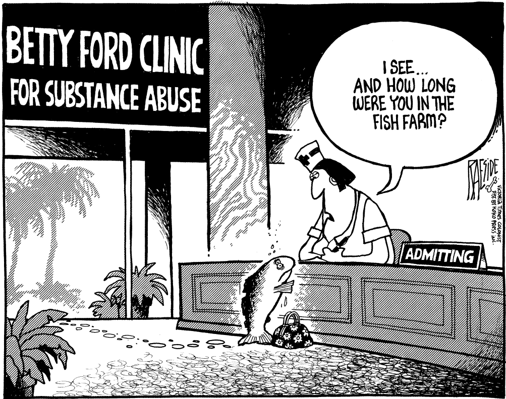
CARTOON BY ADRIAN RAESIDE

salmon from Scotland, the Faroe Islands and Norway were so contaminated that it is safe to eat only three to six servings a year. 5 The salmon farming industry likes to portray itself as an innocent bystander caught up in the crossfire, but it knew as early as the 1970s that the fuel supply for farmed salmon (fish oil and meal from wild-caught fish) was contaminated with carcinogenic chemicals—well before the latest revelations in Science . 6